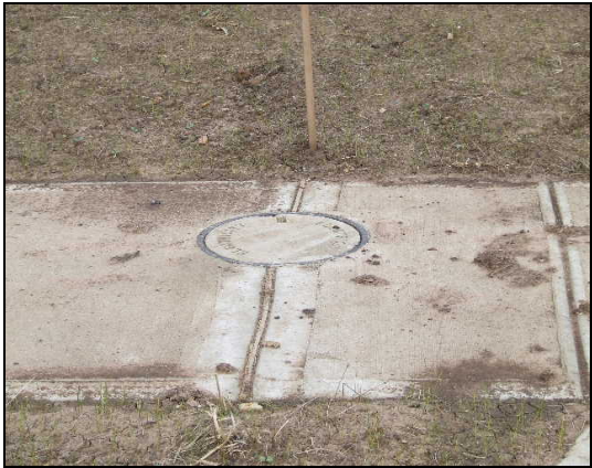
Non Compliant Installation of a Service Pit (within the footpath expansion joint)

Attached is a photo of a non complying situation in a project that was recently constructed, there have also been other recent similar situations.