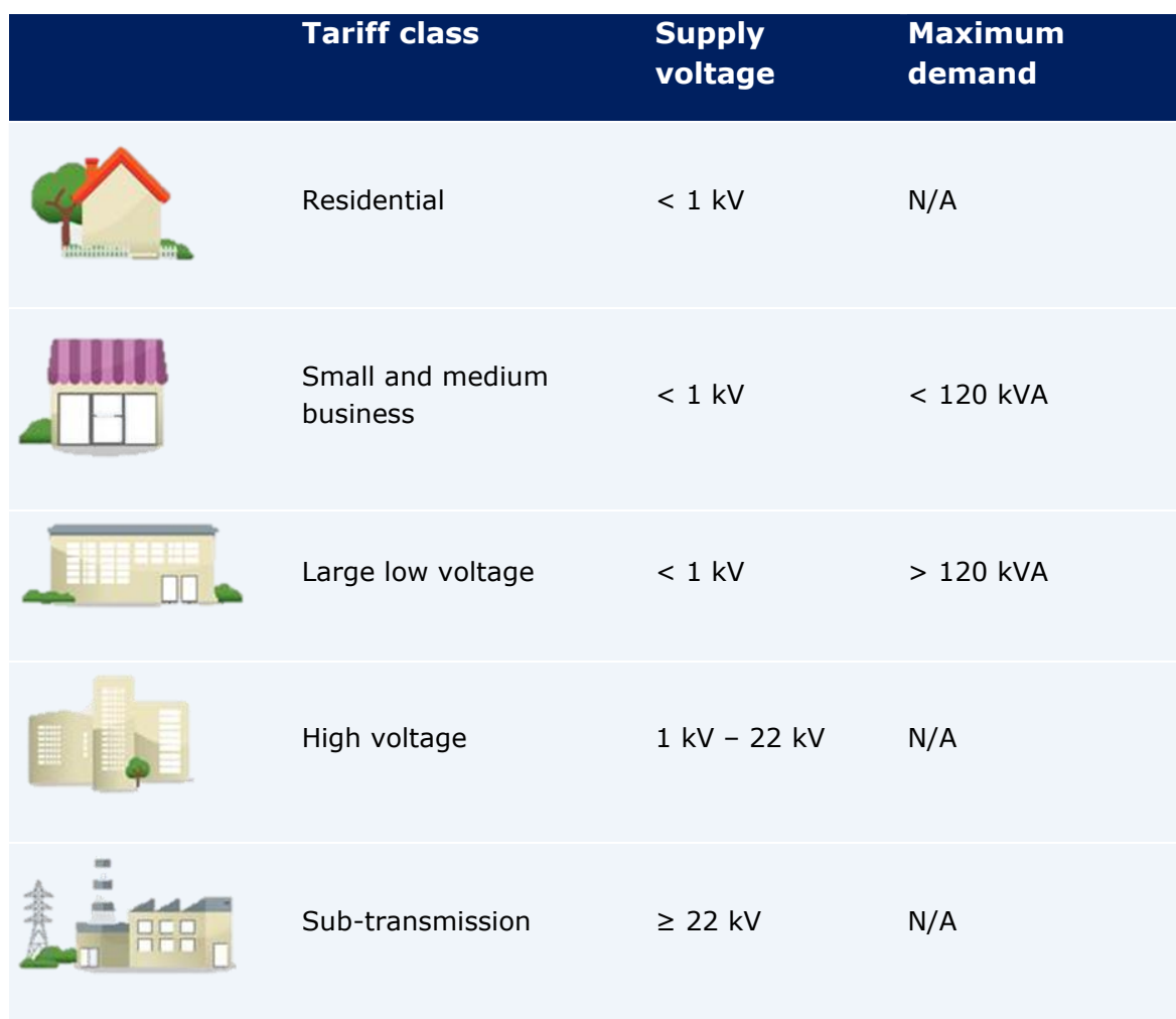
FIGURE 2 TARIFF CLASSES

Our network tariffs can be grouped into the following tariff classes: